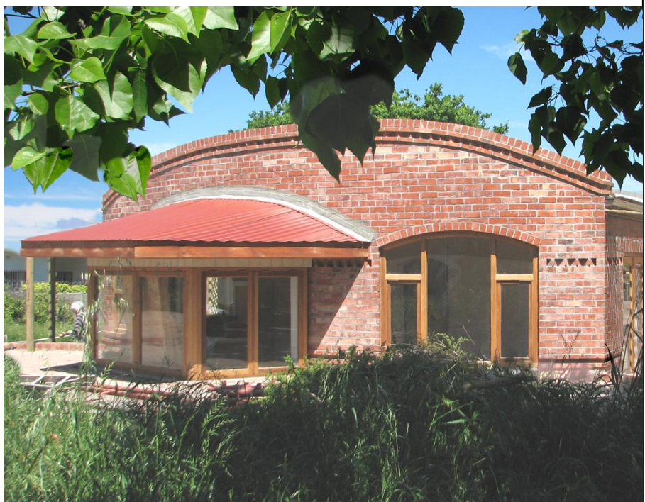
Newly completed Phase 2 of Timour Hall Cottages.