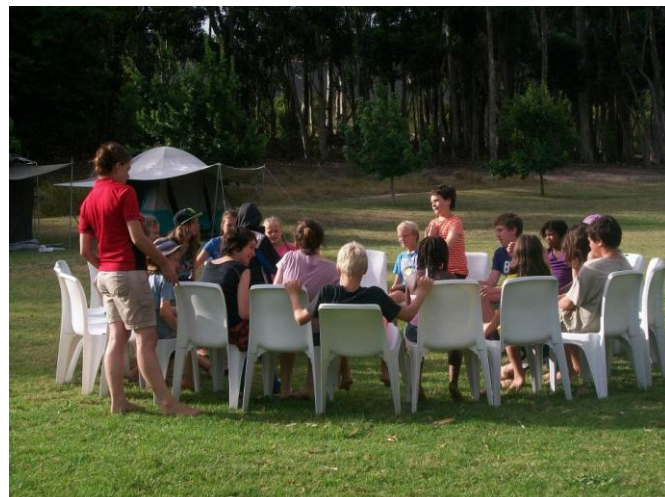
Planning the day or perhaps the Cabaret?