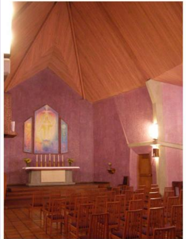
The Christian Community Church in Lima, Peru.