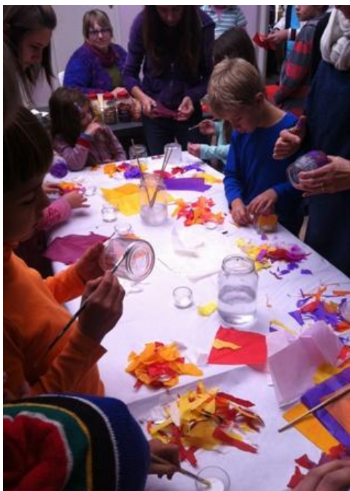
Lantern making requires concentration.

“Deep in the forest in a small hut there lived Erasmus, a Holy Man, who had planted a beautiful vegetable and flower garden ... “