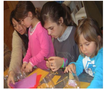
The children make their lanterns.

For Sale: A Sitting Massage Chair (price: R2,000.00) and a massage bed in very good condition with a head piece that lifts up and towel covering (price: R7,000.00). Please phone Elizabeth Straube at Tel. (021)789-0085 only after 28 th September 2012 as I am away until then.