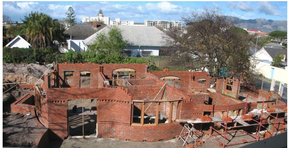
Building Progress as on 22 nd July 2012.