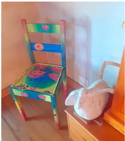
Pictures: More delightful soft toys. Left: at her home and right: at the church.