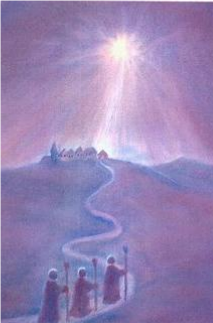
Epiphany – Waldorf Art.