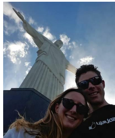
Right: Statue of Christ the Redeemer putting everything around the travelers into perspective.