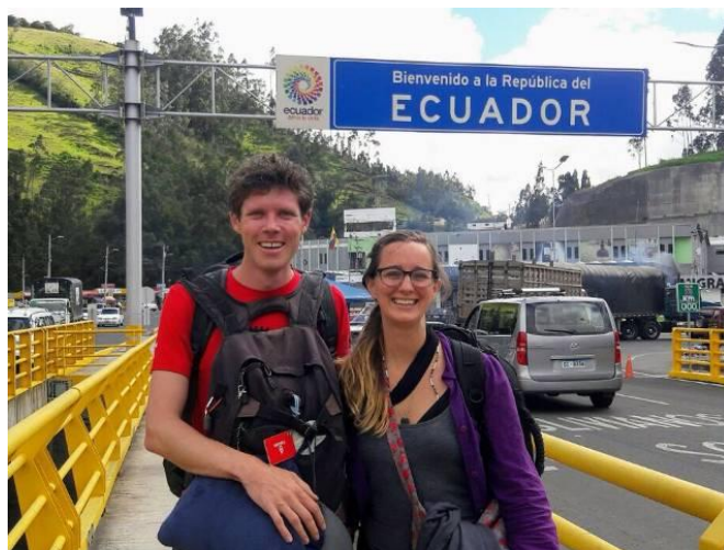
Top: Welcome to the Republic of Ecuador.