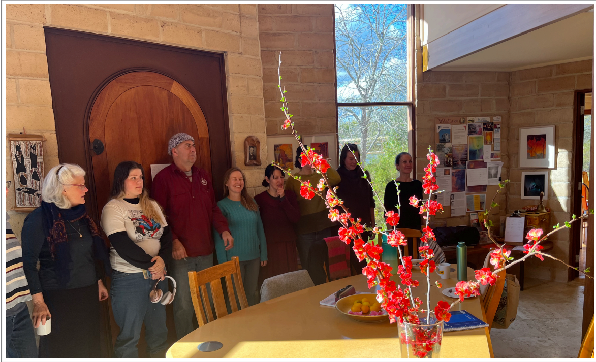
Participants of the conference in Mittagong

Each morning service started with a new lens to understand the Act of Consecration of the Human Being, leading to a deeper experience of the service. Each evening, the sermons by different priests reflected on our daily experiences, guiding us to carry our reflections into our sleep and the realm of the spirit for further processing.