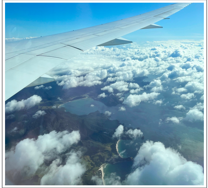
Descent into Auckland, New Zealand